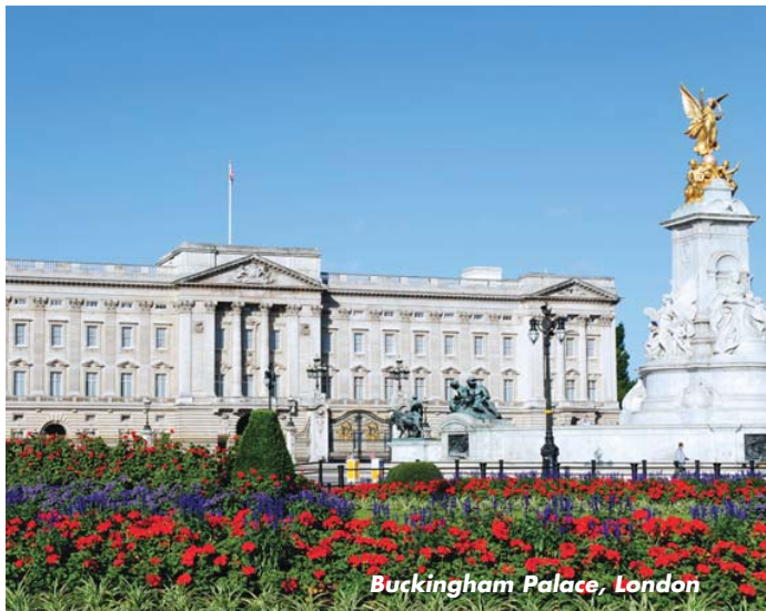
Buckingham Palace, London